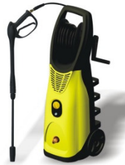
High pressure cleaner