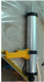
Adhesive gun & cartridges